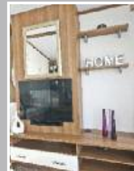
Fire and TV housing