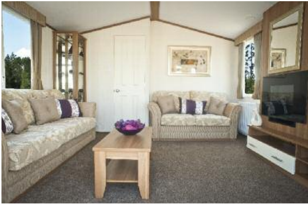
Secluded lounge option available on 35 and 37 foot standard layout models