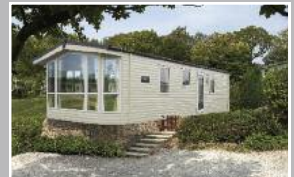
Redesigned front aspect now incorporating pitched canopy