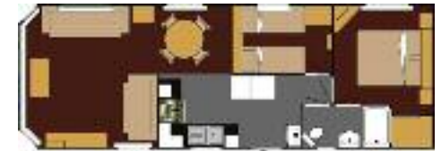
35' x 12' 2 Bedroom