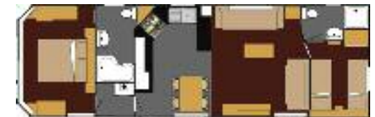
37' x 12' 2 Bedroom - Centre Lounge