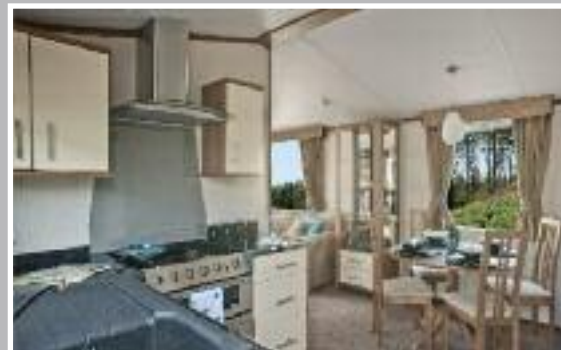
Equally spacious is the kitchen and dining area on these models