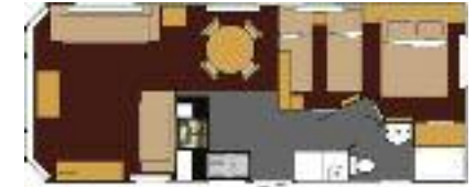
30' x 12' 2 Bedroom