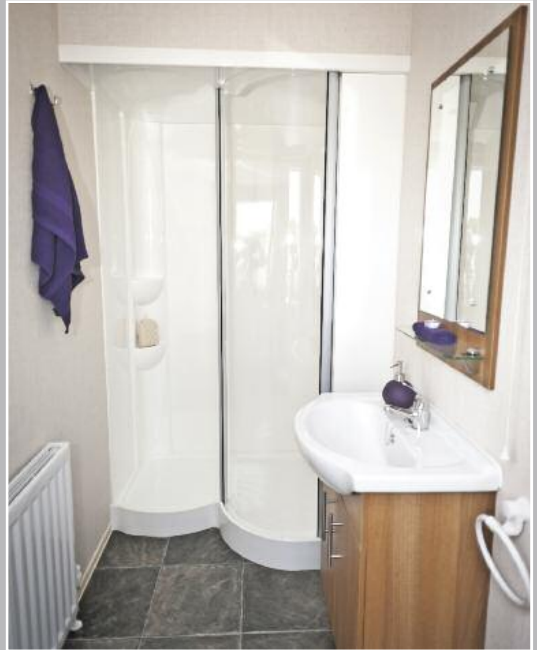
Master bedroom en-suite

“Superior finish and sumptuous holiday living at affordable prices”