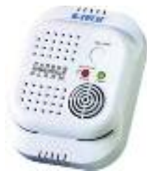
Carbon Monoxide Detector