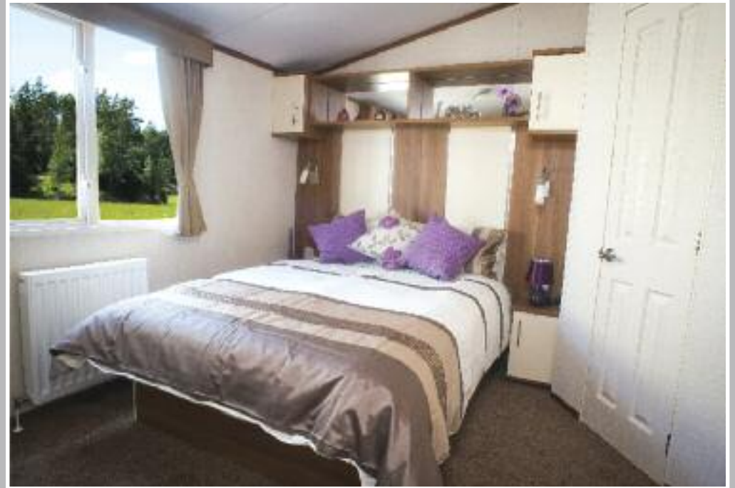
En-suite master bedroom as in 37 foot standard model