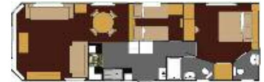
37' x 12' 2 Bedroom