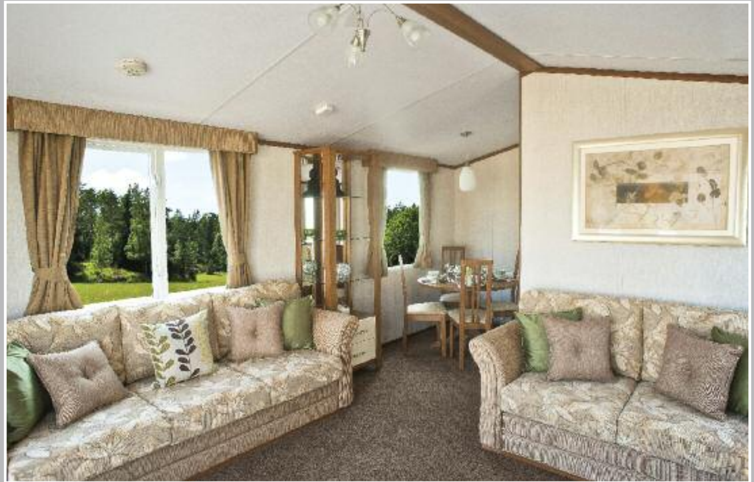
The spacious open plan lounge as featured on all standard layout models