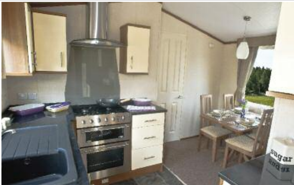
Secluded lounge option kitchen and dining area