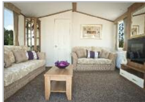
Secluded lounge 35' and 37' models