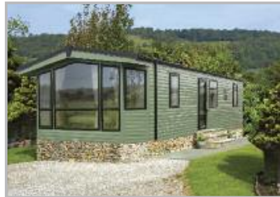
Environmental green exterior